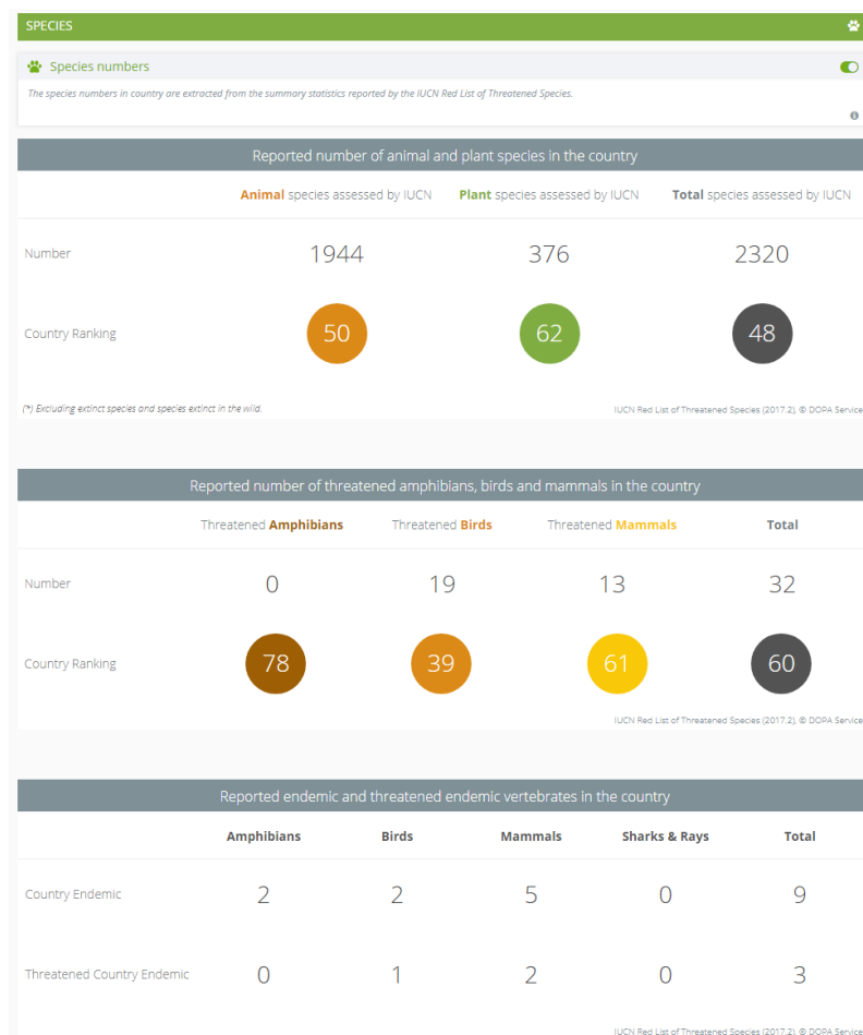
Figure 1. Summary statistics regarding species assessed by the IUCN at country level. These tables should be consulted for example, to obtain a summary of the number of threatened mammals and/or endemic species in any particular country.